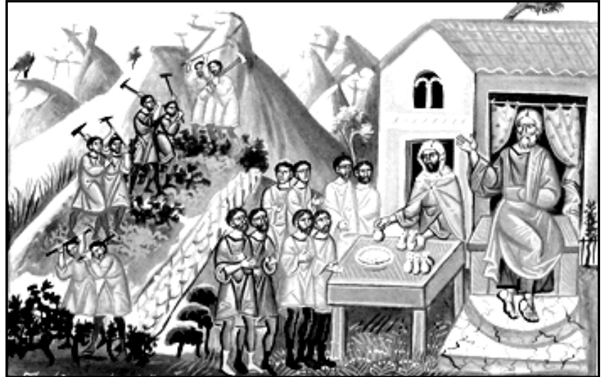
The Laborers in the Vineyard

Here we are facing the 9 th month of the year "September". Summer will soon end and autumn begins. Maybe it will be cooler but don't count on it. Just know that weather forecasting is not my forte. The official end of summer is not Labor Day, Fall doesn't begin until September 22 this year. The Jewish Holidays are early this year with Rosh Hashanah on Sept. 6 and Yom Kippur on Sept. 15 th . Both begin at sundown on those days. Let us remember that our Lord and Savior grew up and worshipped in the temple . " Christ " is the official title of Jesus, meaning " the Anointed One ". It is a Greek word and it means the same as the Hebrew word, " Messiah ".